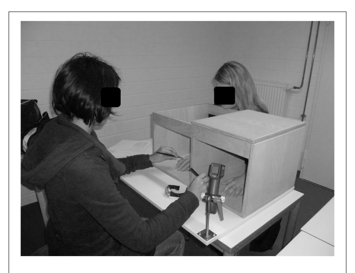
FIGURE 1 | Experimental design of the rubber hand illusion.

The dimensions of the box were similar to those described in Tsakiris et al. (2011) (36.5 \times 19 \times 29 cm [width \times height \times depth]; see Figure 1 ). At the front of the left part of the box, a hole was cut, through which the participant placed his or her left hand. The position of the participant's hand was kept constant by lightly fixing the middle finger to the box with a hook and loop fastener. The top of the left part was closed. The top of the right part of the box was open, through which the participant could see a prosthetic left hand. The entire back side of the box was open to allow the experimenter to brush the participant's hand and the rubber hand.